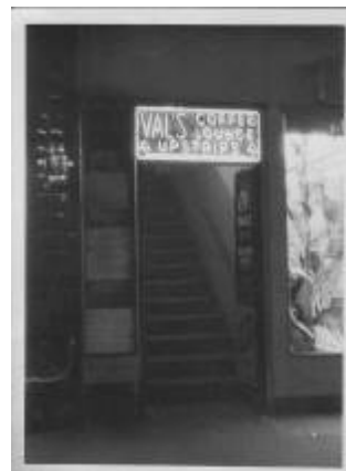
Entrance to Val's early 1950s

Incidentally, there are copies still available of The travelling mind of Val Eastwood , a collection of short stories by Val published by ALGA in 2009, supplemented by photos from Val's album and a transcript of an interview with Val by Ruth Ford in 1995 (cost $25 or $20 to ALGA members – details on the merchandise page of ALGA's website).