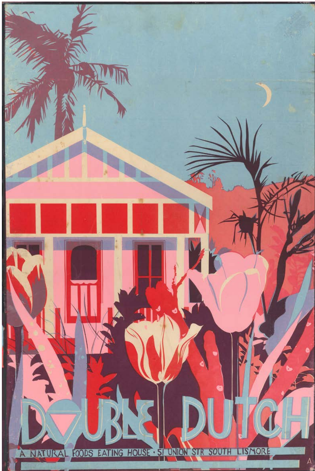
Double Dutch, South Lismore, gay café c.1980s, unidentified designer