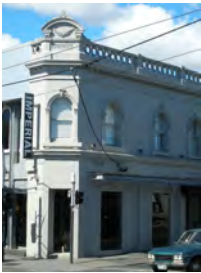
Imperial Hotel (Graham Willett)

‘Bachelor Living in Melbourne’, Australian House and Garden , December 1962